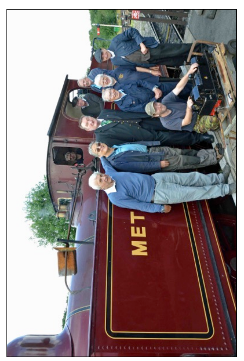
Fetes & Fairs at the Epping and Ongar Railway. 23rd July 2017.