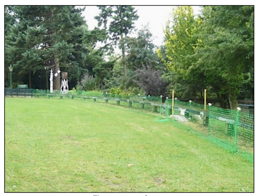
The temporary fence

to prevent the public, children especially, approaching too close to the running line on public running days which is perceived to be a safety hazard as often they can be observed running alongside trains leaving the station or placing hands on the track. Whilst most parents are aware of the safety of their children, children being children can take off in a moment and accidents can happen in the blink of an eye.