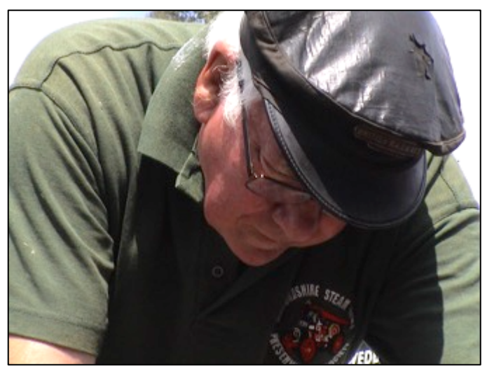
for all to see and do.

Our Fetes and Fairs section enjoyed another successful day in Enfield on the 17th June 2017. This was the second time that the team have been booked to entertain visitors at the school.