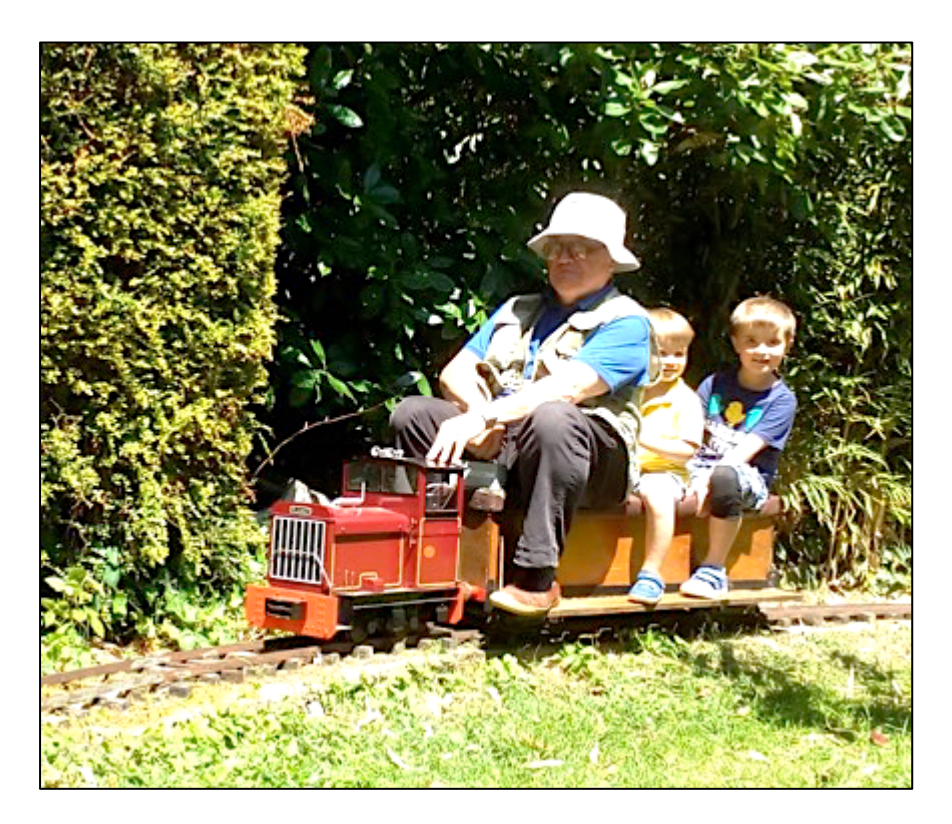
The N.L.S.M.E. visit to Fareham M.E. Society. Saturday 19th August 2017

Fareham have an excellent pond, a Gauge "0" track as well as the usual 3 1/2", 5" and 7 1/4" railways. To round the day off we usually gather at a local (Kings Langley) hostelry for a meal on the way home.