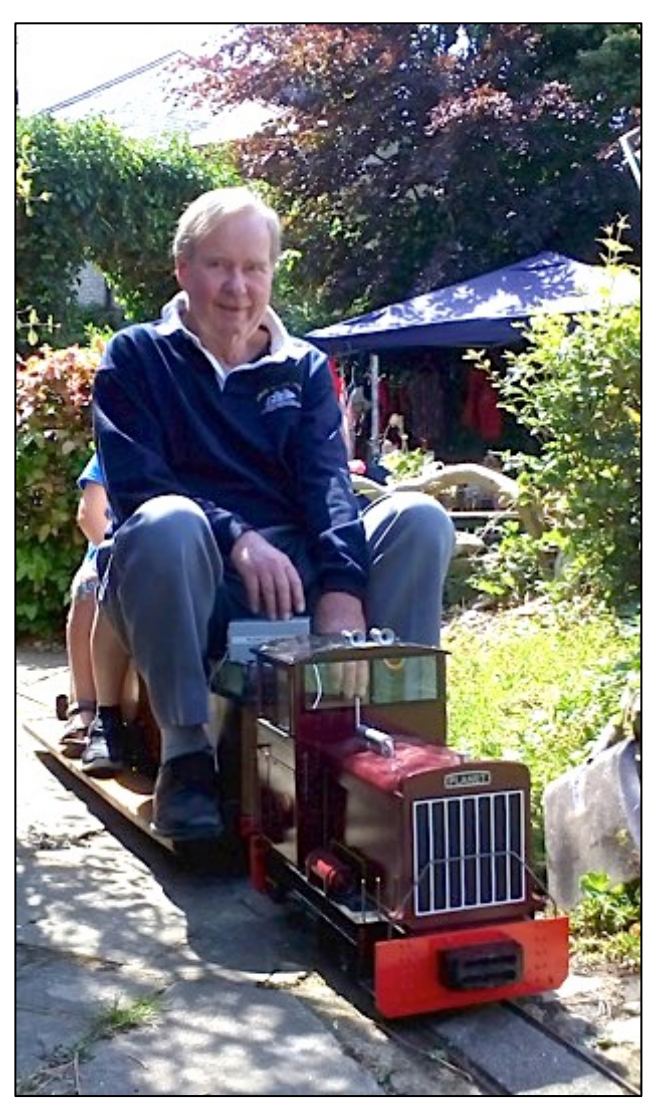
My Open Day, 2nd July 2017

The month of July seems to have gone quickly, Why? Because it has been most enjoyable for us members and with no disasters